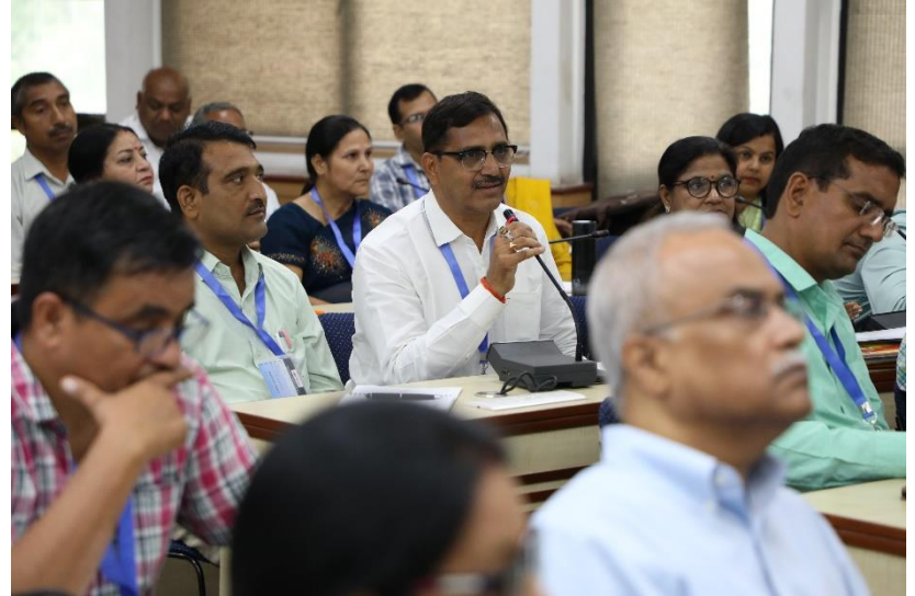
A participant actively participating and posing questions during a session